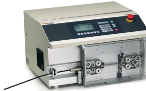
■ PowerStrip 9500