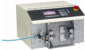
■ OmniStrip 9400