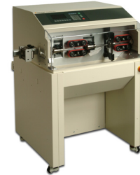
■ MegaStrip 9600